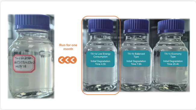
Figure 2 Comparison of TX-1a before and after operation

The use of TX-1 series absorption solvents features extremely strong anti-oxidative degradation capability, which is an exclusive technology in the industry. In long-term continuous operation of engineering installations, the color of the absorption solvent remains almost unchanged, with stable capture performance and stable CO 2 output, it can be recirculated.